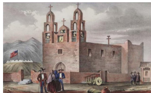
Fort Marcy in the background of this 1846 illustration of La Parroquia, which preceded St. Francis Cathedral.