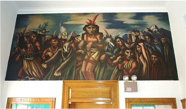
T or C Post Office mural

We would also like to ask you to take the opportunity to stop and read as many historic markers on your journeys to Preservation Month events as possible. Also during May, the National New Deal Preservation Association based in Santa Fe is highlighting New Deal-era murals in New Mexico post offices. As an ongoing opportunity during Preservation Month to see well preserved murals, post offices in Truth or Consequences, Deming, Portales and Raton are open during regular hours and have well-preserved murals on display. Former post offices in Alamogordo (now a county office at 1101 New York Ave.) and Clovis (an architects office at 122 W. Fourth St., also have New Deal murals. The Federal Courthouse in Santa Fe has a second floor mural that originally was painted for a former post office in Gallup.