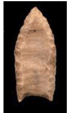
A Folsom point

Folsom Museum sponsors two guided tours to the historical Folsom Archaeological Site, first excavated in 1926-27. This site established the antiquity of human occupation in North America through the excavation of an ancient bison kill site discovered in 1908. It is administered by the state Commissioner of Public Lands. Folsom is 37 miles east of Raton. NM 64/87 to the intersection of NM 325 and 456. Folsom Museum: www.folsommuseum.org , 575-278-2122.