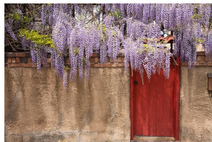
Tudesqui House